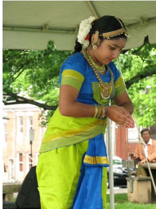
Classical Indian Dancer Festival of Cultures 2008

Thank you, Irena, for your commitment and energy!